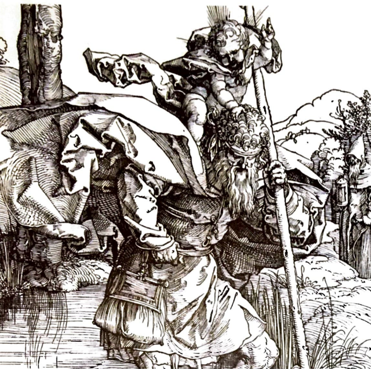
>> This 1511 woodcut print by Albrecht Dürer is called St. Christopher .