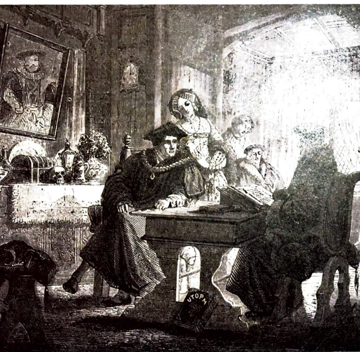
>> Desiderius Erasmus was a Dutch priest and humanist scholar who was active during the Northern European Renaissance. He believed an individual's chief duties were to be open-minded and to show good will toward others.

influenced later Flemish artists, who painted scenes of ordinary people in their daily lives.